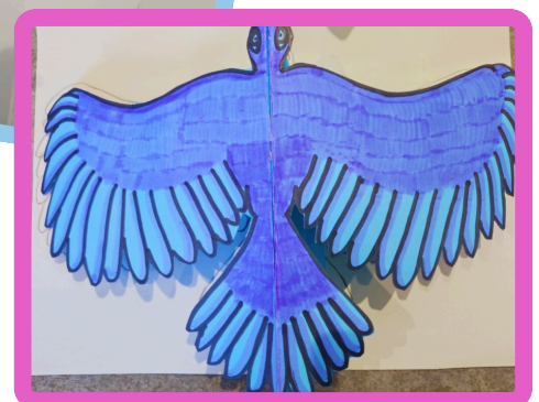
Finished bird example

Watch my wings flap when you move me up and down!